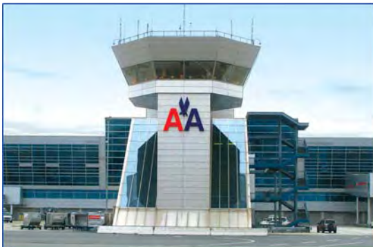
Facilities Condition Assessment at JFK International Airport, Terminal 8 [PANYNJ]

KSE has extensive experience in airport projects including terminals and parking facilities; access roads and light rail connectors; rail access infrastructure including guideways, stations, terminal interface and intermodal connections; control towers; runways, taxiways and aprons; airfield lighting and navigational aids; airfield storm drainage; signage and information systems; and landscape design.