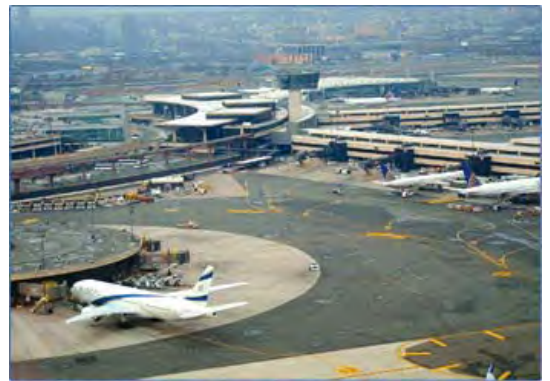
Construction Scheduling Services for Newark Liberty International Airport, Terminal B Expansion Program [PANYNJ]