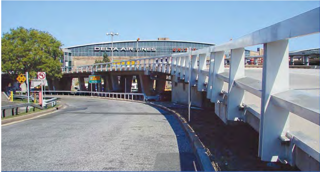
Structural Integrity Inspection of 16 LaGuardia International Airport Bridges [PANYNJ]