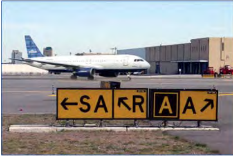
Design of Protective Structures at JFK International Airport - Taxiways Q & A [PANYNJ]