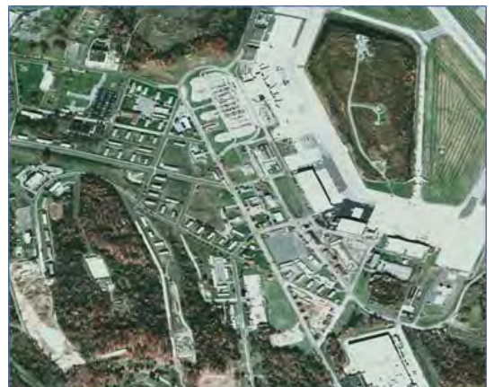
Rehabilitation of Cargo Road Parking Area at Stewart International Airport [PANYNJ]