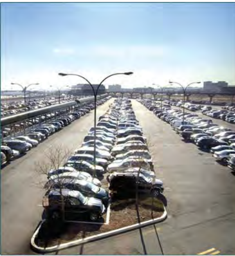
Long-Term Parking Off-Airport Facilities, NY, NJ & PA [The Parking Spot]