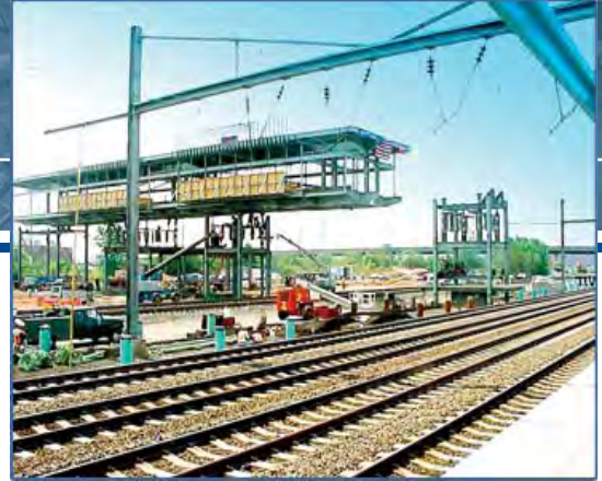
Construction Management Services for Northeast Corridor-Newark Liberty International Airport AirTrain Extension [NJ TRANSIT]

T: 973 . 623 . 2999 • F: 973 . 242 . 2955 info@kseng.com • www.kseng.com