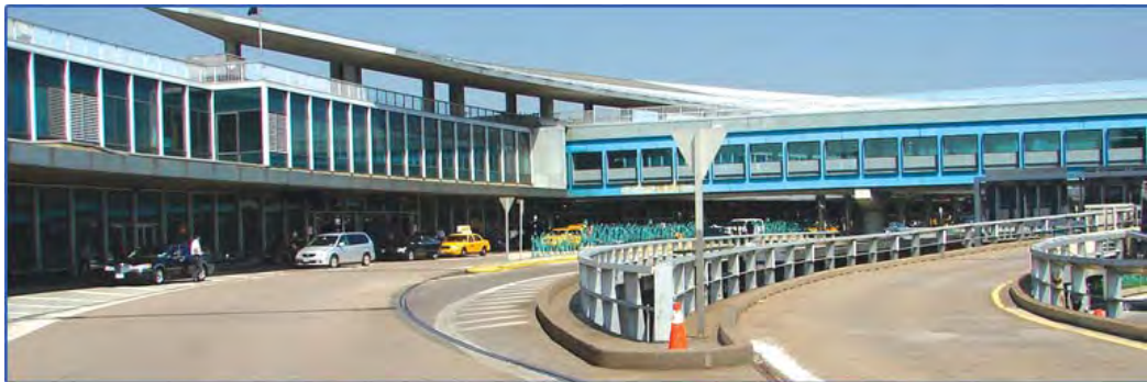
Structural Design Services for Central Terminal Building Upgrade at LaGuardia International Airport [PANYNJ]