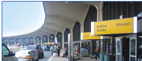
Construction Management at Newark Liberty International Airport and LaGuardia International Airport