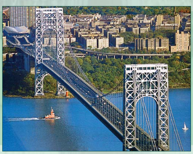
Biennial Inspection & Condition Survey of George Washington Bridge Main Span and NY Approach Spans - PANY/NJ

From concept development to final design, KSE provides the background, skill and experience necessary to provide our clients with performance-based achievements and an established reputation for quality and innovation in bridge engineering and design. Our structural engineers, combined with our traffic and survey staff, provide extensive capabilities in the rehabilitation of existing structures and in the aesthetic design and construction of new and replacement steel, concrete and timber structures including pre-stressed, post-tensioned and curved girder bridges. KSE works closely with all agencies, owners and community groups to ensure the successful completion of assignments, while working in concert with all members of the project team. Our corporate philosophy is based on a total commitment to quality and teamwork to get the project right the first time, every time.