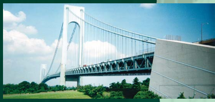
Verrazano-Narrows Bridge Biennial Inspection, Inventory and Load Rating Including Towers, Deck & Lower Roadway - MTA/B&T