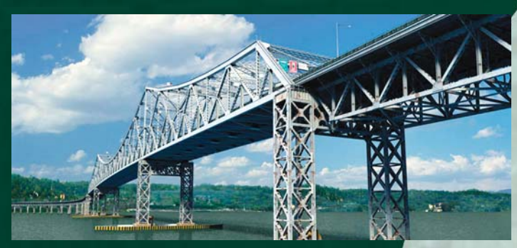
Tappan Zee Bridge / I -287 Corridor Alternatives Analysis / EIS - NYS Thruway