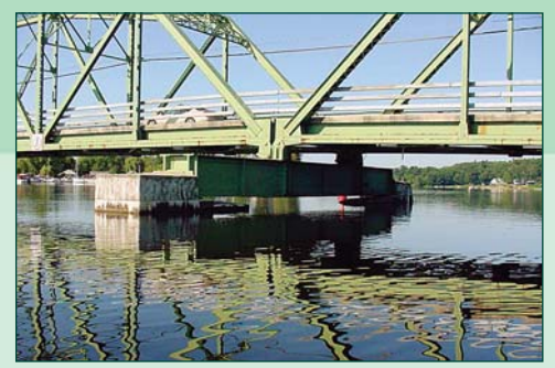
Underwater Inspection of over 150 Structures in Regions 1, 2, 7, 8, & 9 - NYSDOT