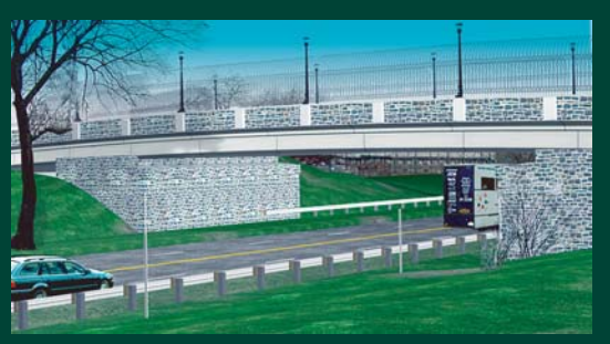
Design & Construction Inspection of Three Lincoln Park Bridges Hudson County