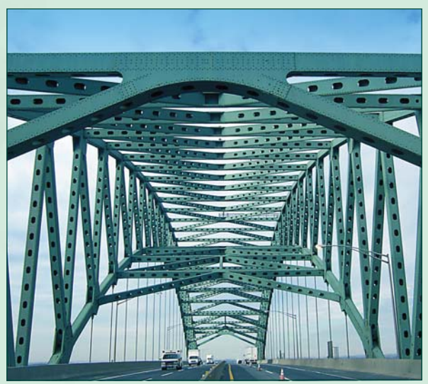
Structural Inspection & Design of Delaware River Bridge Deck Reconstruction - NJ Turnpike