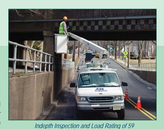
Undergrade Bridges - NJ Transit

While our infrastructure matures at a rapid pace, many of our rural and urban bridges, viaducts and culverts are in need of significant repair, rehabilitation or replacement. \mathit{KSE} is performing much needed condition surveys, NBIS, biennial and structural integrity inspections, load ratings, fatigue analyses, scour analyses of over water structures, and has developed computerized bridge information systems to extend the life of these valuable assets. Our services have ranged from the provision of team leaders and full inspection teams through complete project management, on both minor and major bridges, viaducts, elevated structures and culverts. We have strong credentials as prime, and can also add value to your team on your next assignment.