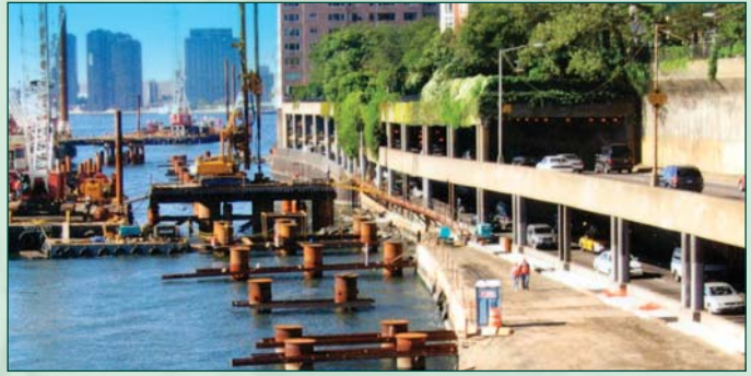
Construction Inspection for the FDR Drive Southbound Roadway Reconstruction and Outboard Roadway Reconstruction - NYSDOT