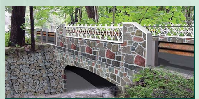
Rendering of Stephensburg Road Bridge Design - Morris County