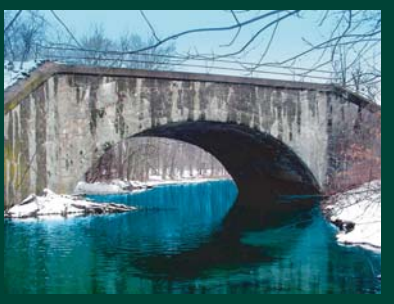
Inspection, Load Rating and Design of Port Jervis Line Undergrade Bridges - MTA / MNRR