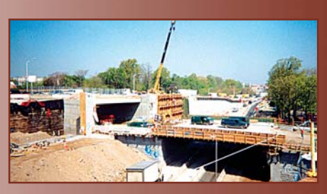
uction Inspection Services for Reconstruction nd Restoration of Brooklyn-Queens Expressway - NYSDOT