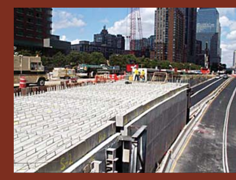
Construction Inspection for Route 9A Promenade South - NYSDOT

Engineers . Surveyors . Construction Managers For All Your Engineering Needs