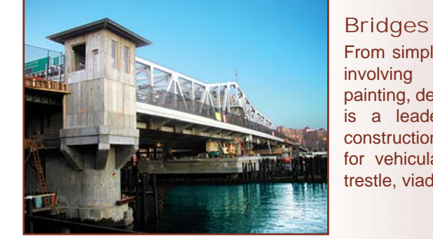
Construction Inspection for the Replacement of the Third Avenue Swing Bridge over the Harlem River - NYCDOT

Construction Inspection for Route 1 & 130 / Georges Road Circle Elimination and Intersection Reconstruction - NJDOT