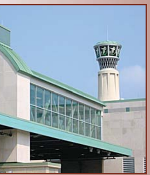
Construction Inspection for Interchange No. 1 Toll Plaza - NJTA

Ne provide comprehensive construction nspection assistance and management for ight and heavy rail, subways, commuter ail, freight rail and high-speed rail, including vards, shops, terminals, stations, bridges and tunnels. KSE consistently meets client expectations and project objectives in a professional and cost effective manner.