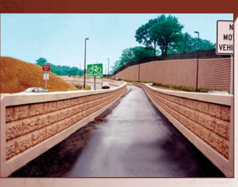
Construction Engineering, Administration and Inspection for Route 18 Extension / Rutgers Improvements - NJDOT 2006 ACECNY Platinum Award Winner

KS Engineers, P.C. (KSE) provides comprehensive construction inspection and management services on projects key to the region's transportation infrastructure, the educational community and for both public and private facilities and buildings. Nearly half of our 95 professionals are supporting clients on construction engineering, inspection and management assignments throughout the region. Whether project needs call for a professional CM to augment the owners staff with pre-planning, design, construction, engineering and management expertise or on-site construction teams consisting of resident engineers and inspectors for reviewing work in-progress for contractor conformance to the specifications, design intent and safety programs, KSE has the expertise in carrying out successful field programs. We are a full-service, award winning, state certified engineering, survey and construction management MBE/SBE/DBE.