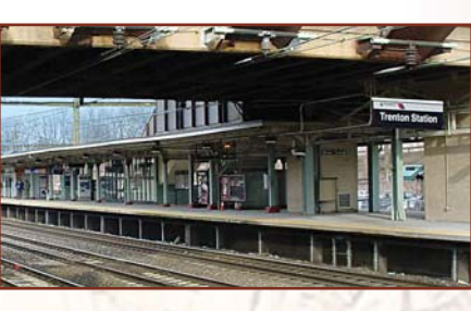
Construction Management for the Rehabilitation of Trenton Station - NJ Transit