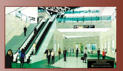
Construction Management for the Fulton Street

For commercial, residential, educational and transportation facilities and buildings, KSE provides on-site resident engineering, management and inspection services for contractor conformance to project requirements and compliance to design intent, safety and quality control.