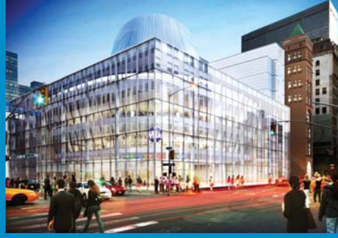
Construction Management Fulton Street Transit Center - MTA / NYCT