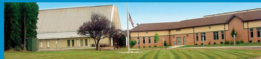
Site / Civil Engineering Conley & Hoppock Schools - Bethlehem Township, NJ