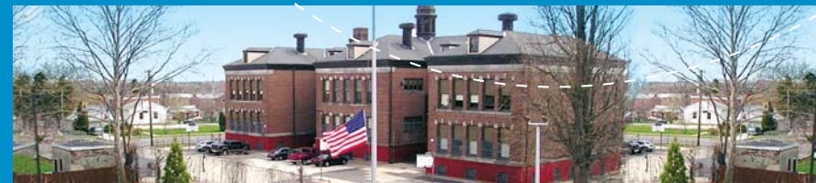
Civil Design Services for Renovations Penrose Elementary School & Motivation High School Philadelphia, PA