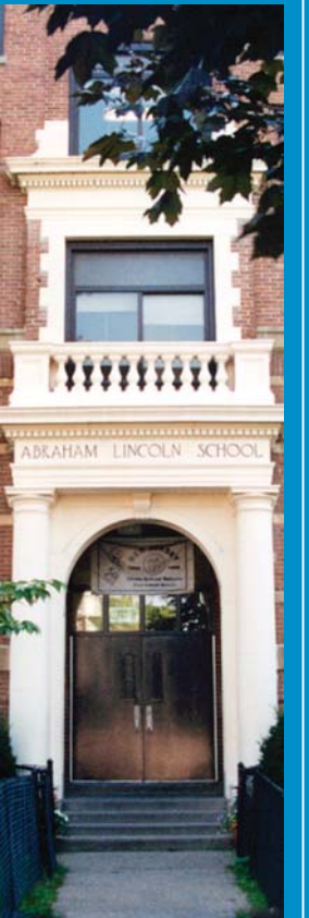
Boundary & Topographic Survey Abraham Lincoln School #14 - Elizabeth, NJ