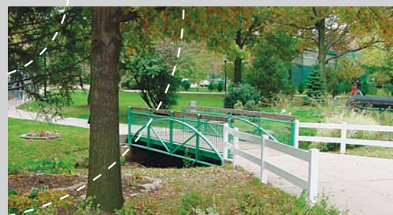
Kean University Design Projects Union, NJ