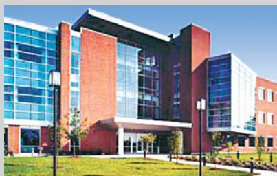
Design Projects University of Medicine & Dentistry of New Jersey