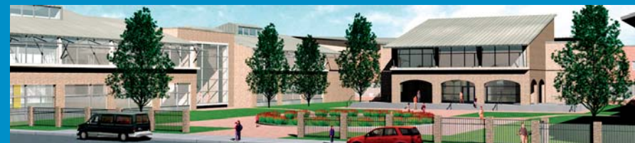
Structural Design Gloucester City New Elementary / Middle School Gloucester City, NJ