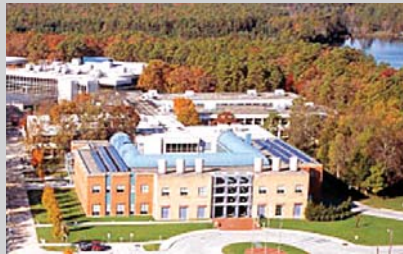
Structural Design of Athletic Field at Richard Stockton University, NJ

KSE is committed to maximizing the value of every dollar that our clients spend on campus improvement projects. KSE is well versed in the latest 'green' design techniques. Our LEED certified professionals help our clients make the most of their natural and financial resources.