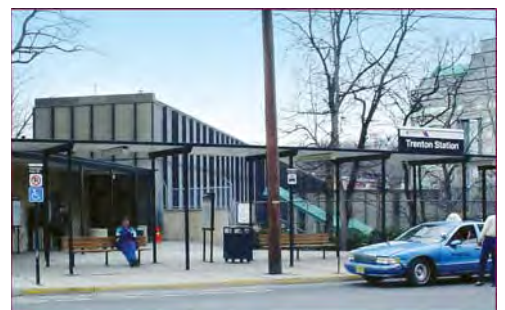
Trenton Station Rehabilitation Construction Management [NJ TRANSIT]