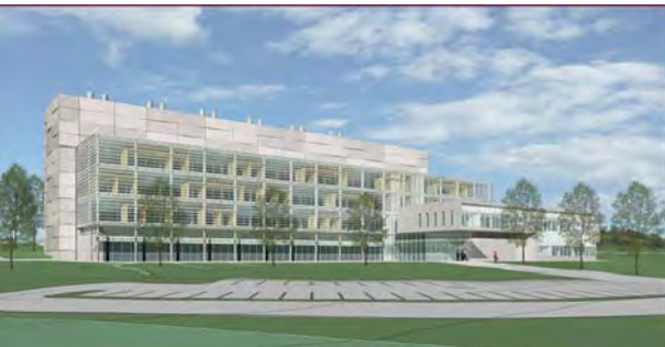
NJ State Police Headquarters Complex Queuing Building, Civil & Geotechnical Engineering [New Jersey Building Authority]