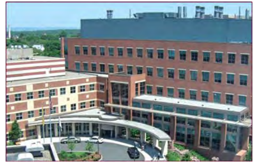
Renovation of Robert Wood Johnson Medical School [University of Medicine & Dentistry of NJ]