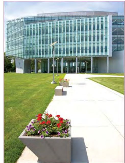
Kean University Science Center Civil & Traffic Engineering