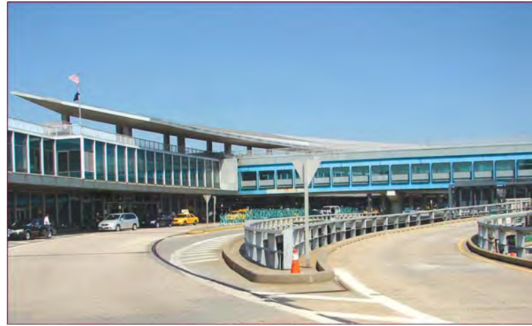
Structural Design Services for Central Terminal Building Upgrade at LaGuardia International Airport [PANYNJ]