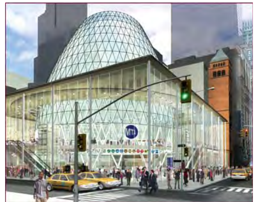
Fulton Street Transit Center Construction Management [MTA/NYCT]