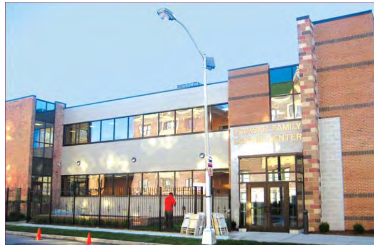
The Senior Center Construction Management & Renovation [City of East Orange]