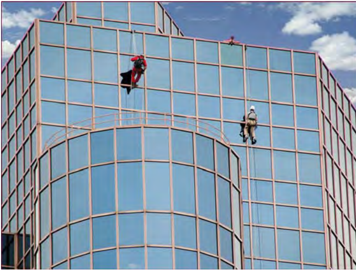
Facade Condition Inspection at Newark Legal Center [PANYNJ]

Whether a building is brand new or a century old, it has a unique character to be respected. KSE is the right firm to provide you with timely recommendations and economic solutions to the facility challenges that you are facing.