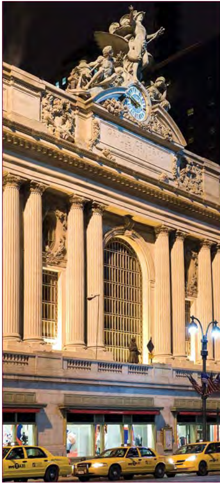
Grand Central Terminal Structural Evaluation & Rehabilitation Design [MTA]

Today, the management and maintenance of existing facilities is just as important as the design and construction of new ones. KS Engineers, P.C. ( KSE ) recognizes this need and approaches these projects with a complete understanding and concern for combining economical feasibility with basic efficiency.