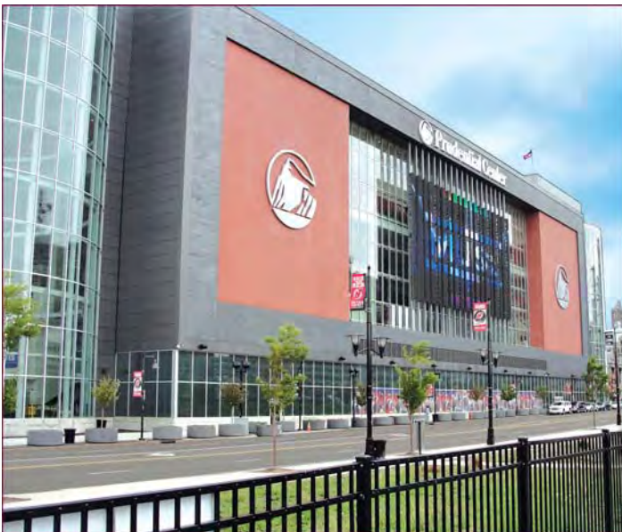
Prudential Center Foundation Design [Newark Housing Authority]