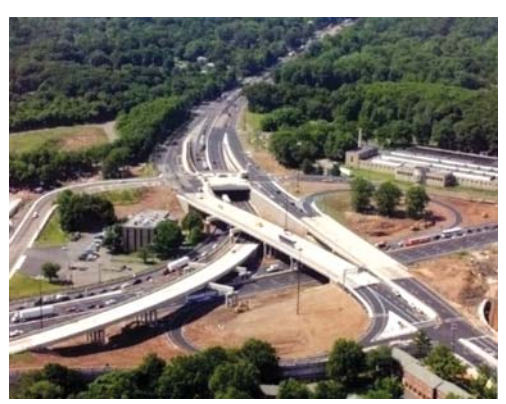
Construction Inspection for Route 1 & 130 – NJDOT