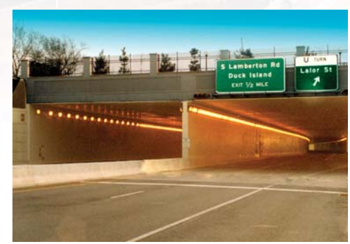
Route 29 Tunnel, Signalized Intersections, Roadway Lighting Design - NJDOT