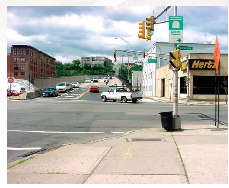
14 Street Viaduct Design in Hoboken - Traffic Engineering & Survey Services - Hudson County

KS Engineers, P.C. (KSE) provides a full range of professional engineering, design and survey services customized to be compatible, environmentally sensitive, economically feasible and community focused in meeting our clients' needs and objectives. We work in partnership with our state, county, local and institutional clients to deliver the best possible solutions to today's difficult challenges on toll roads, interchanges, controlled access highways, park and rides, arterial highways, country and municipal roadways and streets, and inner-city networks. From concept development and preliminary engineering, including design alternatives and context sensitive solutions, through final design and construction support, KSE has the knowledge, experience and understanding to deliver high quality, sustainable engineering solutions for improved mobility and economic vitality.