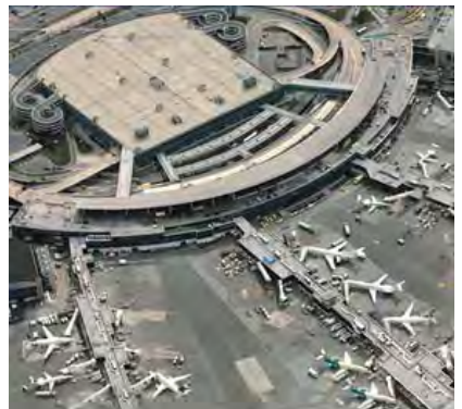
LaGuardia International Airport Central Terminal Building Upgrade Design [PANYNJ]