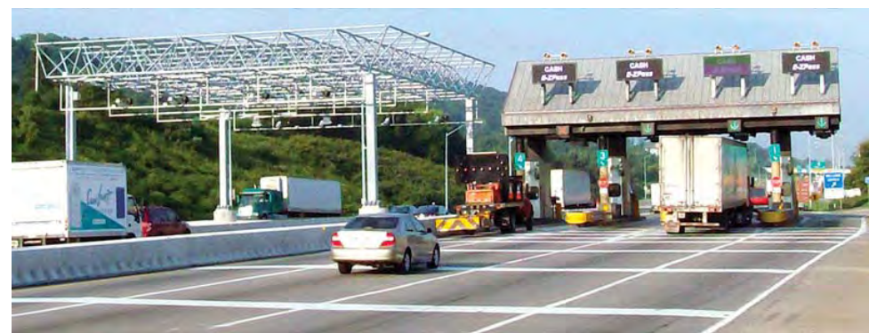
I-78 Open Road Tolling at the Delaware River Crossing Design/Build [DRJTBC]