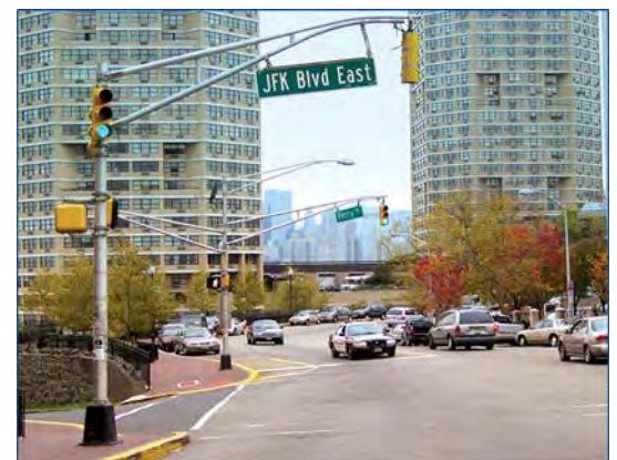
Design & Construction Management for Traffic Signal Improvements [Hudson County]

Understanding how traffic flows is essential to the success of any project, and it changes according to the time of day and time of year. KSE has worked on numerous projects requiring traffic engineering and management. With experience spanning from traffic studies to signal design to MPT plans, KSE's professionals are well-versed in the traffic issues of the area and have the proven ability to streamline this contentious aspect for any project.