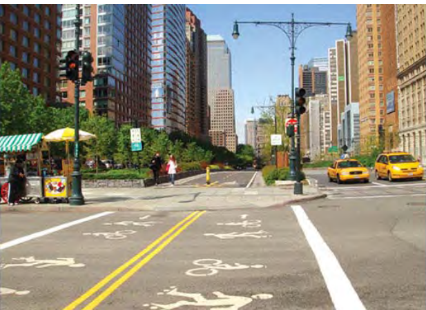
Construction Inspection Services for the Reconstruction of Route 9A Promenade South [NYSDOT]