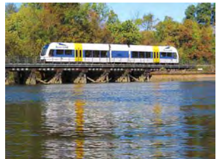
Southern New Jersey Light Rail Transit Park & Ride Design [NJ TRANSIT]