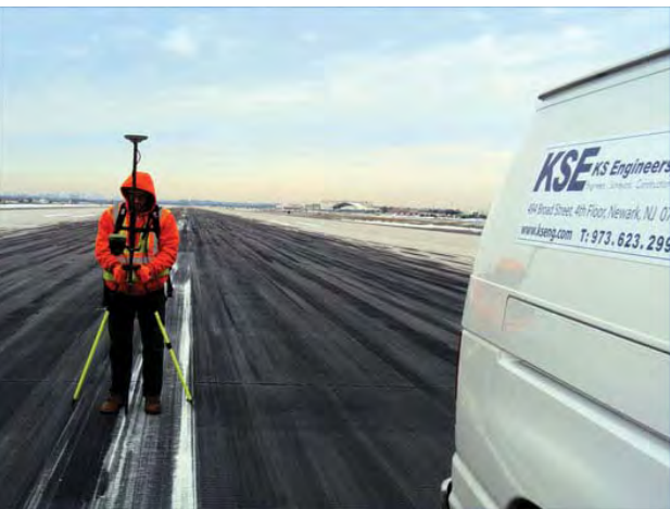
Obstruction Survey & Runway Profiles at JFK International Airport [PANYNJ]