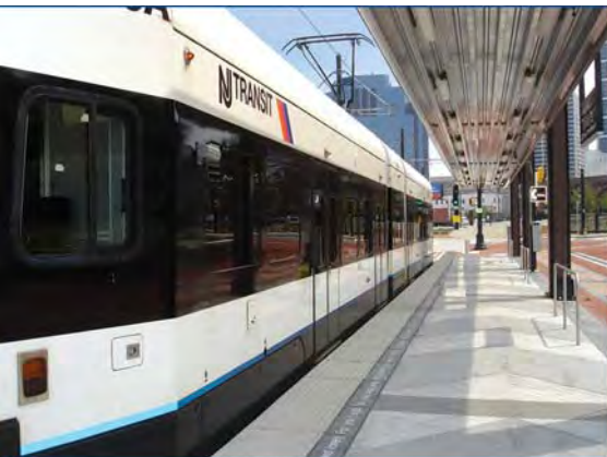
Newark Light Rail Design & Construction Support [NJ TRANSIT]

Our talented professionals offer a thoughtful approach based on extensive experience. From highways and bridges to rail and transit, KSE can mold a project from initial planning and studies; to survey and design; to resident engineering and inspection; to construction.