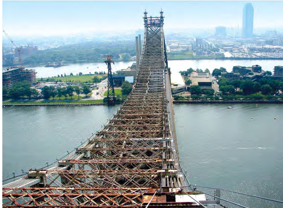
Biennial & Interim Inspections of the Queensboro Bridge [NYSDOT]